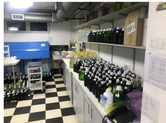
Site visit to “Institute MOL” - Laboratory for waste classification and characterisation