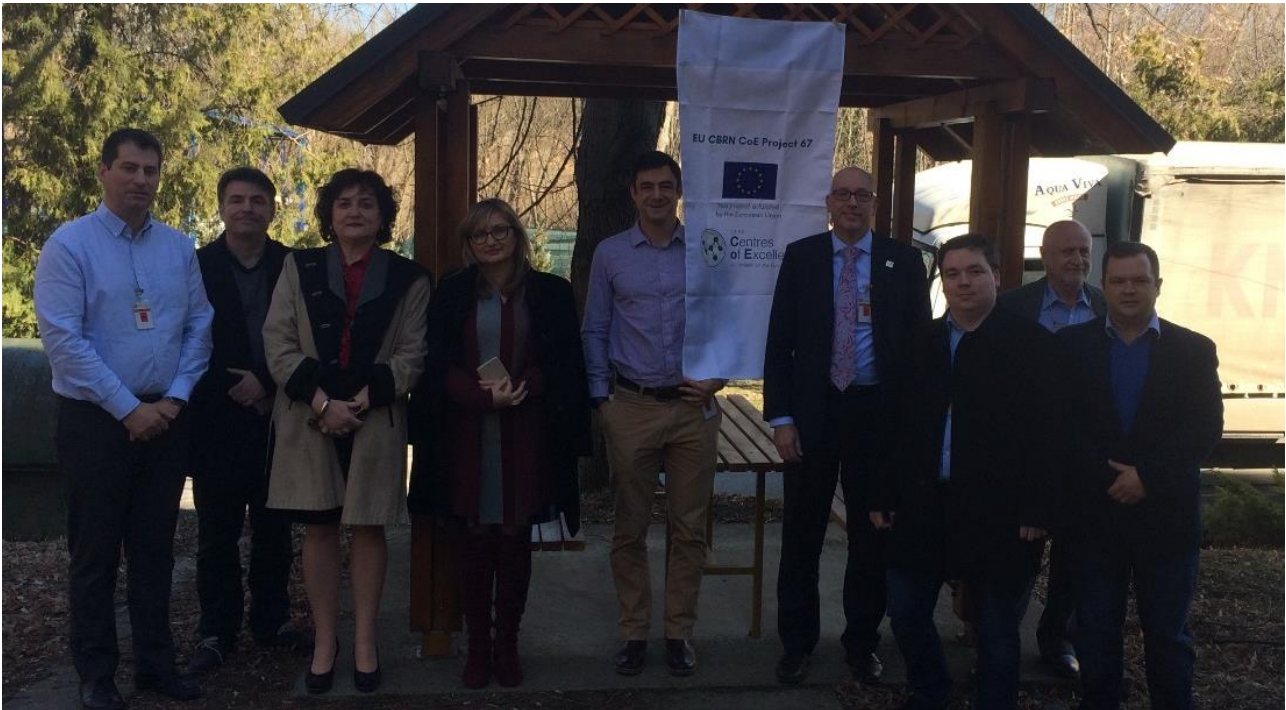
Assessment Visit opening meeting at PE “Nuclear Facilities of Serbia” / VINČA Institute of Nuclear Sciences

CBRN Centres of Excellence An initiative of the European Union