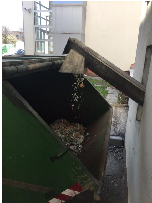
Left: waste generated by medical shredder

CBRN Centres of Excellence An initiative of the European Union