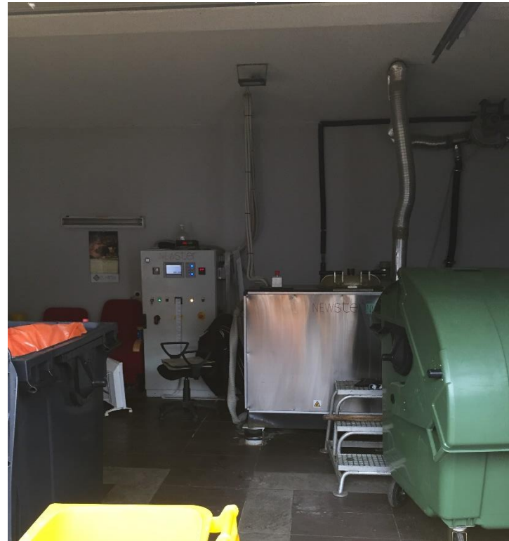
Right: chemical waste treatment facility