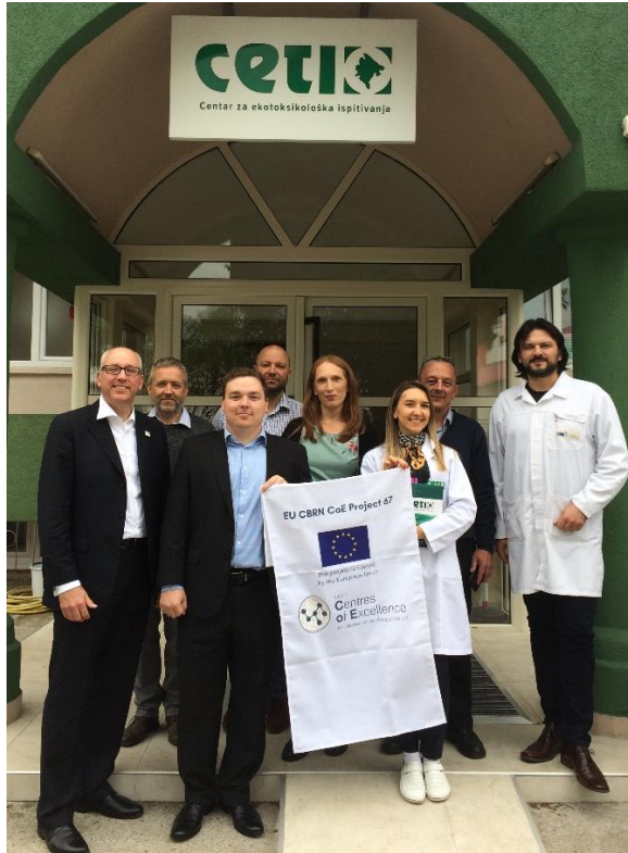
Left: Montenegro and P67 consortium representatives at the opening meeting of the assessment visit

CBRN Centres of Excellence An initiative of the European Union