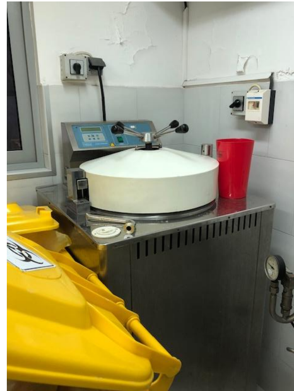
Right: Autoclave used to disinfect bio-medical waste at research institute