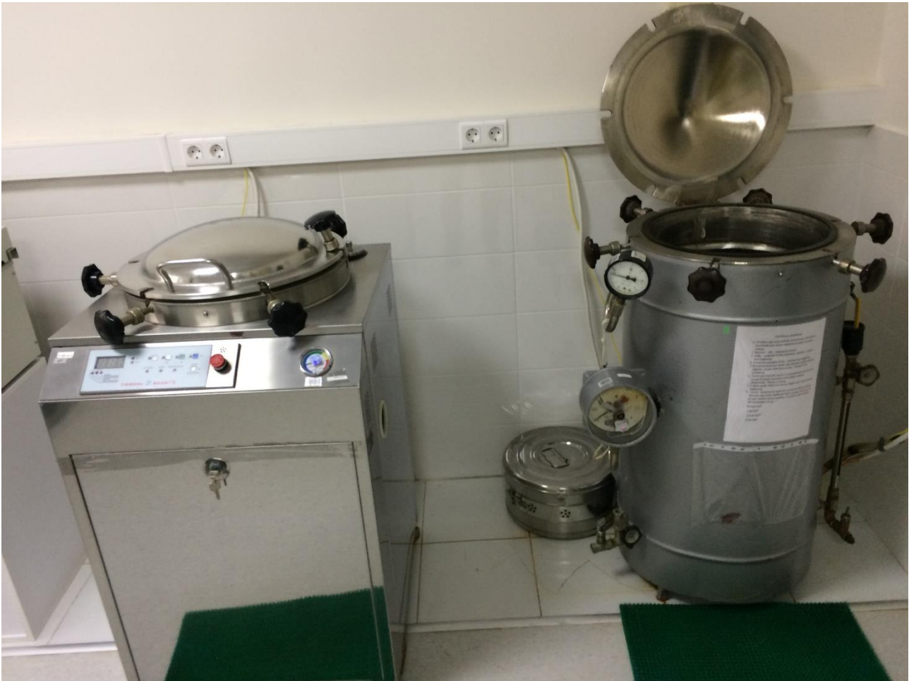
Site visit to the Azerbaijan Food Safety Institute